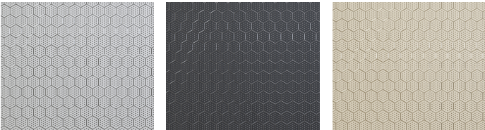
Brushed Nickel Gun Metal Brushed Brass